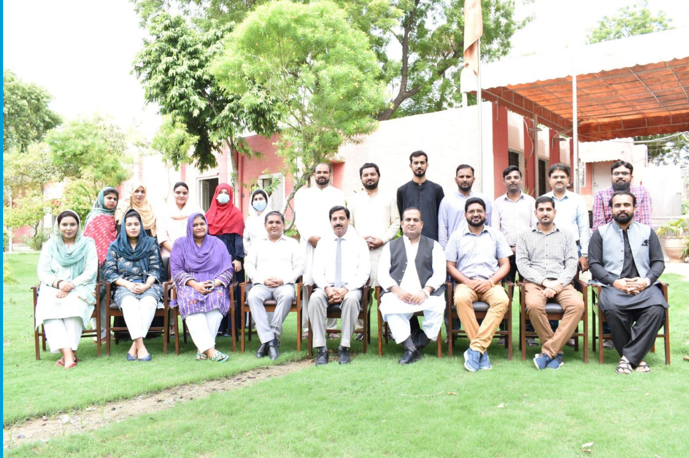
Group Photo of Teaching Faculty with Principal