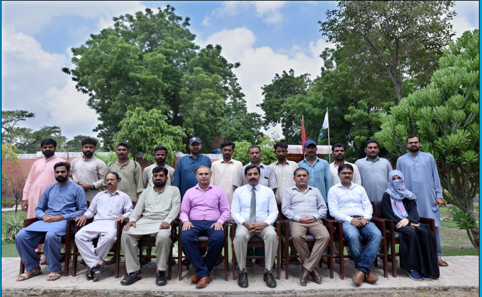
Group Photo of Non-Teaching Faculty with Principal