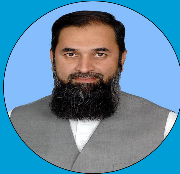
Baligh Ur Rehman Governor, Punjab Chancellor